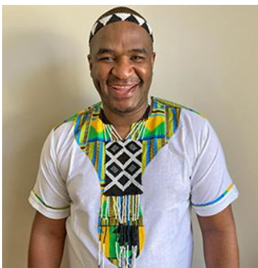
Unathi wears Xhosa beadwork with West African colors