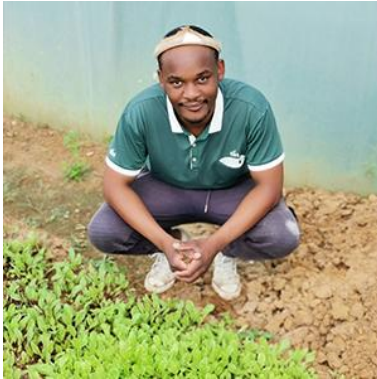
Menzi sporting a Zulu headband worn by married men