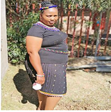
Mantombi wearing traditional Zulu attire for women